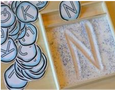
snow writing tray